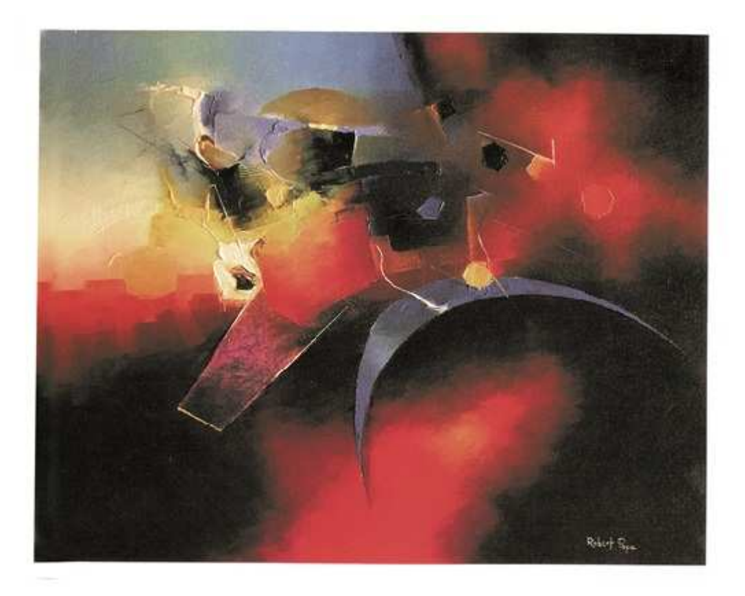
Aesthetison Drive, oil on canvas, Robert Pope

Creativity is an emergent phenomenon patterned by strange attractors, which govern the complexity of information in dynamic flow. If you can't see how to use continually less matter, energy, space, or time (physical resources) in your scheme to improve human performance, then, we submit, that one isn't operating at the 'leading edge' of the tidal wave - somewhere else on the planet things are flowing much faster and more efficiently, and will soon change your game. How can we give people a choice as to which values they want to maximise first, so that different cultures can take different paths toward a diverse yet neg-entropic future? One approach is illustrated by the following painting: