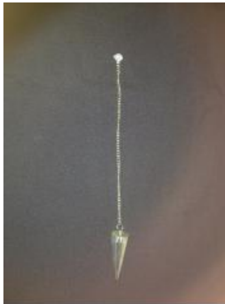
Figure 2. Crystal Pendulum

We now take up the topic of human consciousness. We could have used muscle testing to illustrate the measurement of the level of consciousness but here we present a simpler method. The measurement device is a crystal pendulum hung with a chain and a glass bead attached at the other end (see Figure 2). These pendulums are available commercially for a low price for anyone who desires to conduct these experiments.