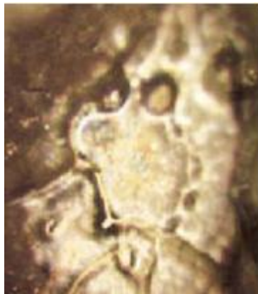
(a) Before Prayer