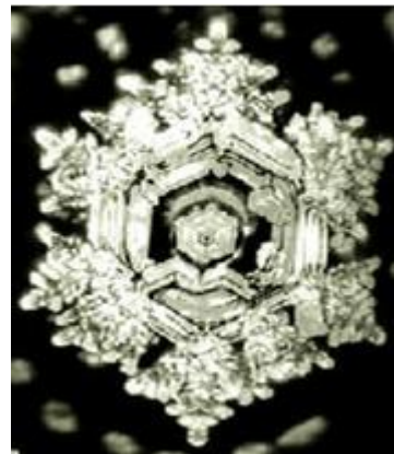
(b) After Prayer