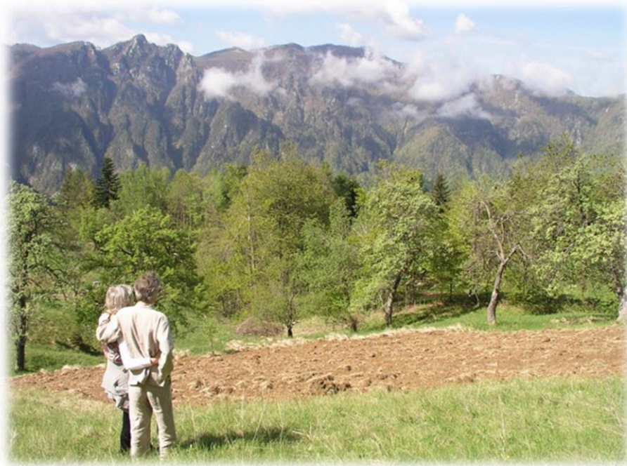
Magic view from the place where this book was written

The more you tune with consciousness smaller is traffic of thoughts and emotions you melt in peace and true happiness. Do not give much attention to the clouds your real nature is beyond the sky.