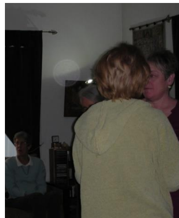
Figure 3. Photos from Session 1 (April 2013) (Photo at the top was taken at start – No Orbs)