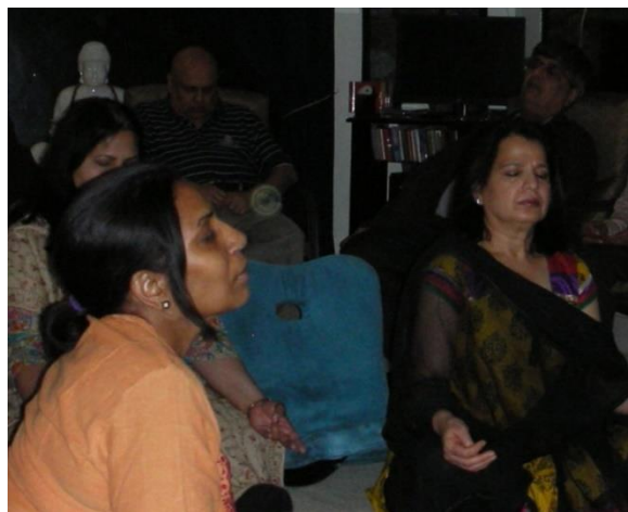
Figure 4. Photos from Session 2 (April 2013) (Photo at the top was taken at start – No Orbs)