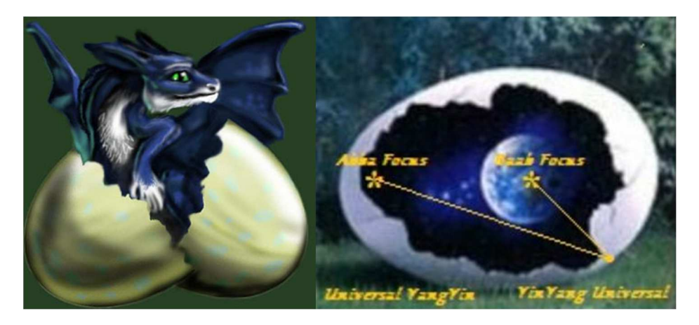
Future Shadows of the Past

Love to all of you and please remember, that all that you consider not to 'Be You', nevertheless is 'All of You'. The day will come, when you shall understand this rather well.