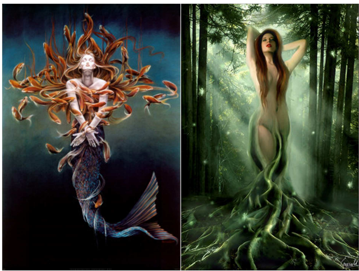
Metamorphosis by Sheila Wolk and the Dryad by Asel Club

The difference between the metaphysical super-energy and the physical energy is found in the derivatives of the mass-associated physics of a thermodynamically closed system, say as the thermodynamic Planckian Black Body Radiator.