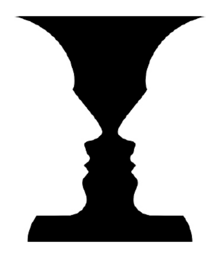
Figure 1. Optical Illusion.

Something must be strangely said about the very unusual experience of hearing a pitch-inverted song for the very first time. In some cases the music comes out as not sounding right, confusing, and more like a failure showing less than the expected 100% success rate now reported. Some of this is due to small errors that end up getting corrected, and doing the inversion by hand can introduce errors. However, this can't be the only reason for the initial confusion. Its like looking at the Figure 1 below, and getting confused about seeing a vase or two opposing faces.