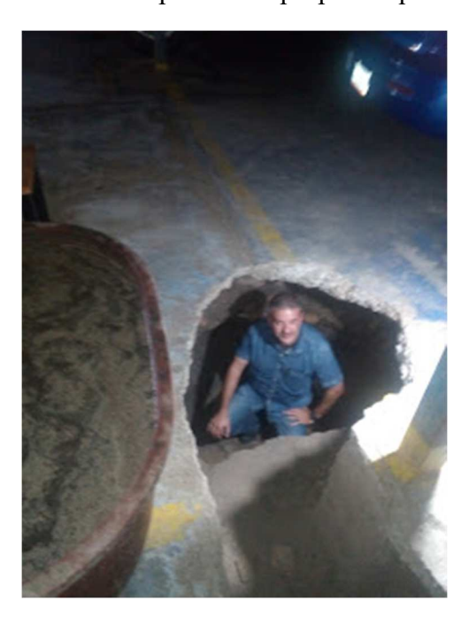
Figure 1. Akasha deposit

model of consciousness and its relationship with the proposed quantum consciousness model.