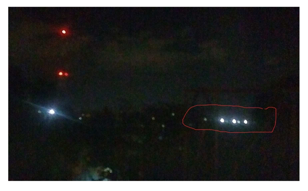
Figure 6. Pleiadian Spaceship