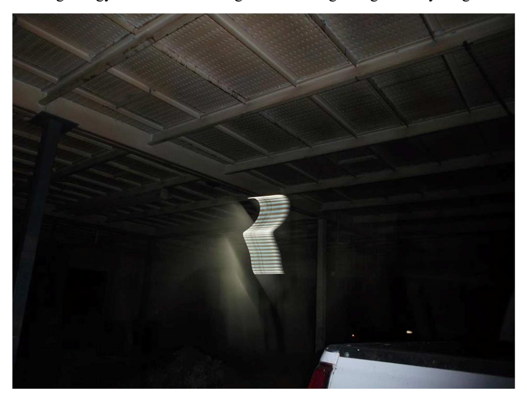
Figure 3. Figure 10 String of Quantum Energy in Sol's Akasha deposit

This energy has polarity, polarity is a universal principle (Levarie 1980). Everything is impregnated with these 2 energies: antimatter and dark matter. According to Jungman, Kamionkowski & Griest (1996), there is almost universal agreement among astronomers that most of the mass in the Universe and most of the mass in the Galactic halo is dark matter. This is what forms the vibrations in the universe, the vibration that pulses of energy. Everything is permeated with this vibrating energy. Then these 2 energies are the beginning of everything.