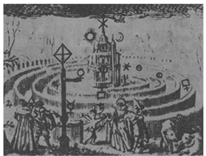
Fig. 2. The sanctuary of the philosophers' stone ( lapis ) at the center of the planets' orbits. From Van Vreeswyck, De Groene Leeuw . In Jung's Psych & Alch , Fig. 51.

Indeed, says Jung, after mentioning that our total personality includes the unconscious "This totality is composed of the ego and the non-ego [the unconscious]. This is why the center of the circle expressing the totality wouldn't correspond to the ego but rather to the Self, the keystone (epitome) of the total personality ( the center with the circle is also a well-known allegory of the nature of God)." He then mentions the Atman (the personal Self) having a cosmic and metaphysical quality or facet as a "supra-personal atman" (in fact, called purusha or brahman , the cosmic consciousness). (Jung, Psych & Alch , Part 2, III2, Pg 137; Fr. 142). The philosophers' stone, or Lapis, the symbol of the achievement of the Totality of Man, thus stands at the Center of the Circle (Fig. 2).