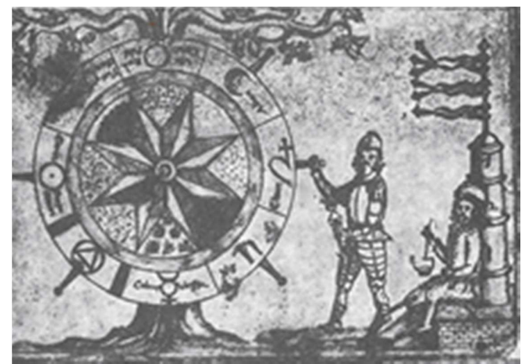
Fig. 3. The Rotation as key alchemical process: Mercurius activating the 8-ray wheel. From Speculum Veritatis , 17<sup>th</sup>c. In Jung's Psych & Alch , Fig. 80.

Interestingly, the Rotation (and circumambulation) is also a key process in the alchemical Great Work, the crucial dynamics (guided by Hermes/Mercurius himself) in order to reach the stage of the Stone – the marriage Moon-Sun, or the fusion ego-Self (Fig. 3).